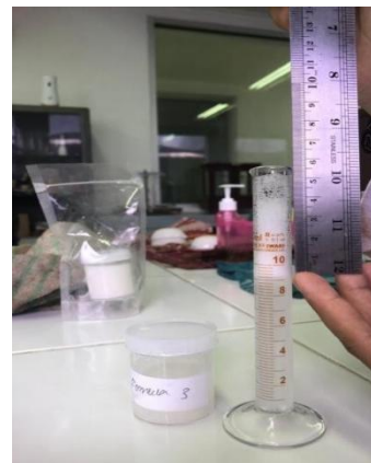
Photographs of the Foam Height Test of Grapeseed Oil Shampoo Formulations