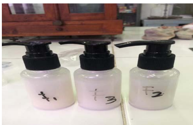
Organoleptic Evaluation Results of Grapeseed Oil Shampoo Formulations