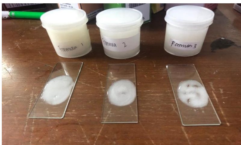
Homogeneity Evaluation Results of Grapeseed Oil Shampoo Formulations